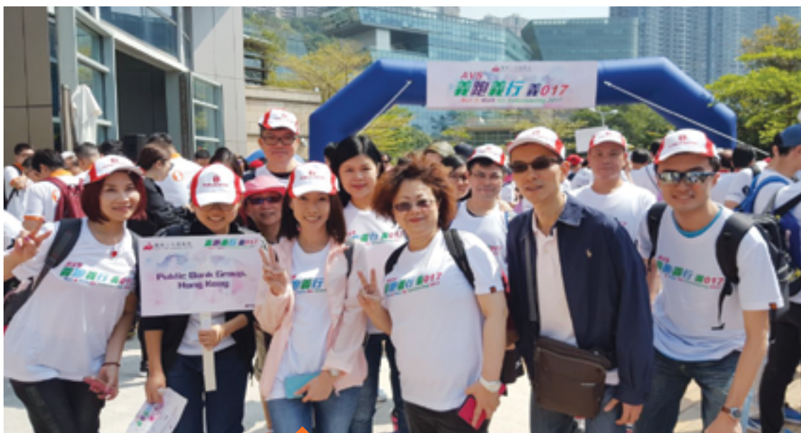
A Group Photo of PB We Care Team Volunteers All Set to Go

Public Bank Group, Hong Kong participated in another charitable event “Run & Walk for Volunteering 2017” organized by Agency for Volunteer Service (“AVS”) to help raise fund to support the development of volunteerism. The AVS event was held on 22 October 2017, Sunday in Cyberport Hong Kong. The Group sponsored the PB We Care Team volunteers to take part in the “V-walk event”.