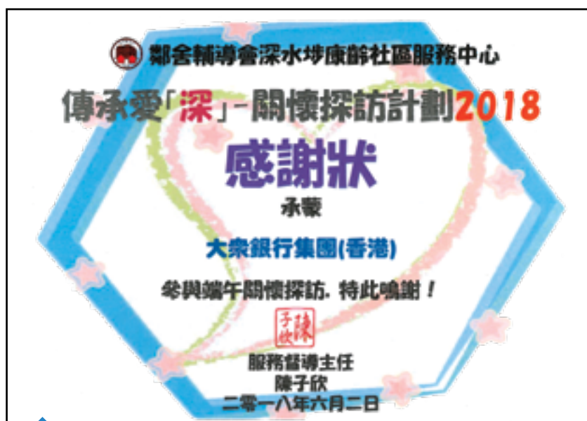
Certificate of Appreciation was given to each volunteer by the organizer.

大眾義工隊同事們均感是次長者探訪活動十分有意義和值得參與，他們所付出的時間直接地讓長者們感受到愛與關懷及被重視，在臨近端午佳節的一個下午共渡了愉快的時光！