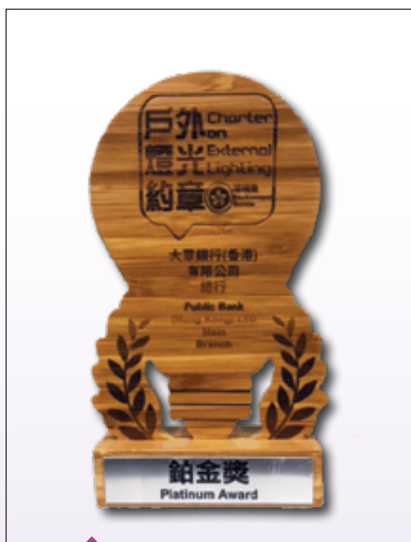
Platinum Award of Charter on External Lighting

Public Bank (Hong Kong) has been awarded the Platinum Award of “Charter on External Lighting” organised by the Environment Bureau for two consecutive years. In compliance with the Charter, 26 branches of the Bank have their external lighting switched off daily from 10:30 p.m. to 8:00 a.m.