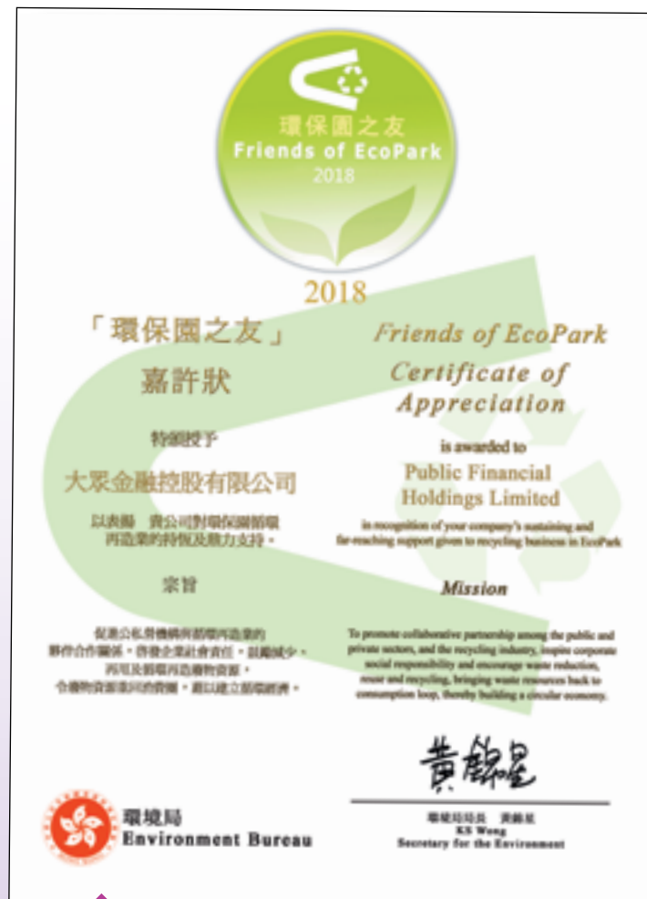
Certificate of Appreciation presented by Friends of EcoPark 2018

本集團將繼續努力推廣環保文化，並在日常業務中回收和重用不同物料。我們亦鼓勵員工在日常工作中遵循最新推出的「實踐綠色辦公小貼士」。