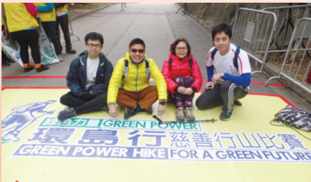
All set and ready to go!

雖然參賽代表隊未能在比賽中勝出，集團仍很高興能夠派出代表參與這個極有意義的慈善行山比賽，透過捐款來推動多項本地環境保護計劃，並衷心感謝參與是此行山活動的同事們所付出的努力和汗水！