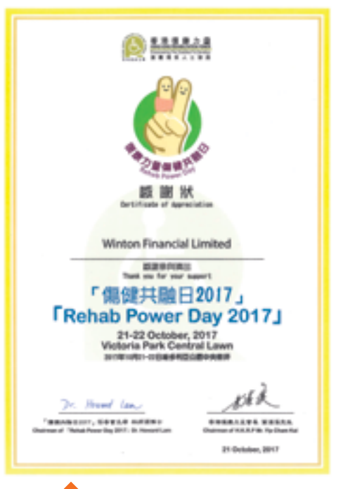
Certificate of Appreciation from the Hong Kong Rehabilitation Power.

「復康力量傷健共融日2017」是次籌款活動非常成功，香港復康力量特意頒贈感謝狀予各參展機構以感謝其對復康力量傷健共融日的參與和支持。運通泰管理層亦讚賞有份參與的員工們，於整個週末付出寶貴的時間，並花心思籌備這項甚具意義的活動。