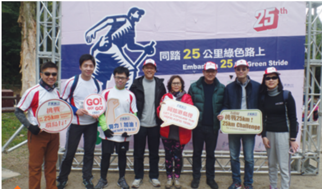
Senior Management and Senior Managers from the Bank and Finance giving their support and cheers to the team before the kick off.

natural landscape. They also passed the Tai Tam reservoir, Shek O country park and old villages along the trail which they too enjoyed seeing.