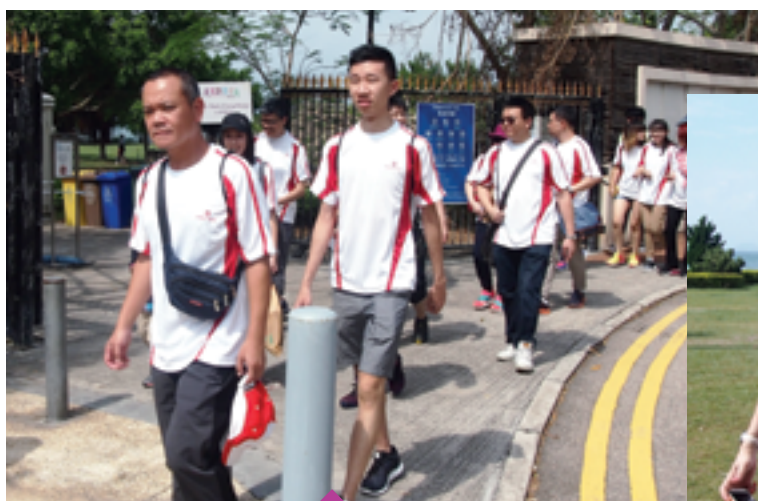
Volunteers enjoying the walk together