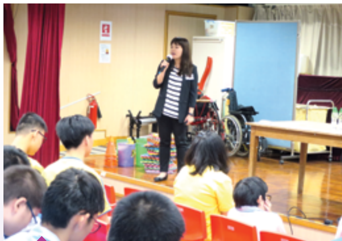
Students listening attentively to the staff from the Human Resources and Training & Development Department

Public Bank (Hong Kong) participated as an employer speaker from the banking sector in the “Career Talk for Schools” held by Employees Retraining Board (“ERB”). The Bank delivered a career talk to students at Hong Kong Red Cross Princess Alexandra School (“HKRCPAS”) on 9 October 2018. The HKRCPAS is a special school comprising a primary and secondary division under Hong Kong Red Cross in providing education and rehabilitation services to students aged 6 to 20 with special needs.