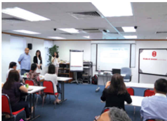
Corporate Culture & Social Responsibility Team introducing the guest speaker from ALBA