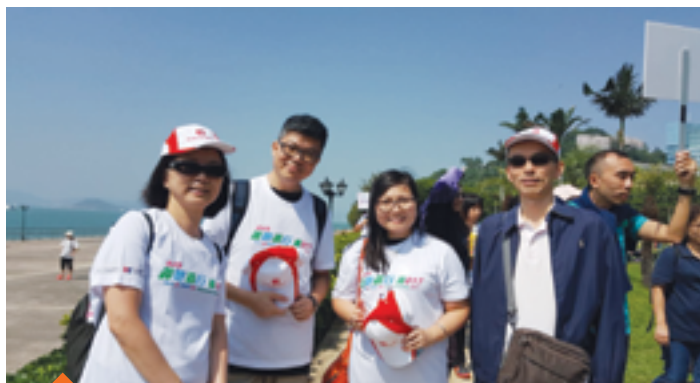
PB We Care Team Volunteers enjoying the walk together

The volunteers walked leisurely to enjoy the beautiful sceneries along the route. At the end of the finished point, all volunteers were greeted with congratulatory message and was presented with a "Certificate of Merit" for completing the 3.5 km walk.