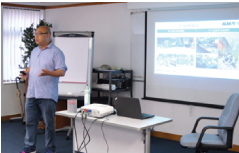
Guest speaker explaining the electrical and electronic waste disposal process in Hong Kong

Public Bank (Hong Kong) organised a three-day Waste Electrical and Electronic Equipment (“WEEE”) Recycling Campaign with the introduction of a Go-Green Talk at the Training Room held on 10 August 2018 for staff. The objective of the talk was to create awareness and understanding of Hong Kong Government’s new “Producer Responsibility Scheme on WEEE” (“Scheme”) that came into effect on 1 August 2018 and also to share ways of reducing wastage.