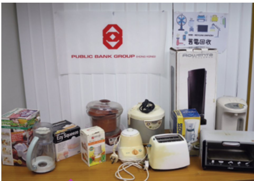
Unwanted electrical and electronic items donated by staff

總體而言，是次環保午間講座及廢電器電子產品回收運動確實提高了員工的環保意識，使員工更支持本行保護環境的措施，與政府一起推動保護環境的運動。