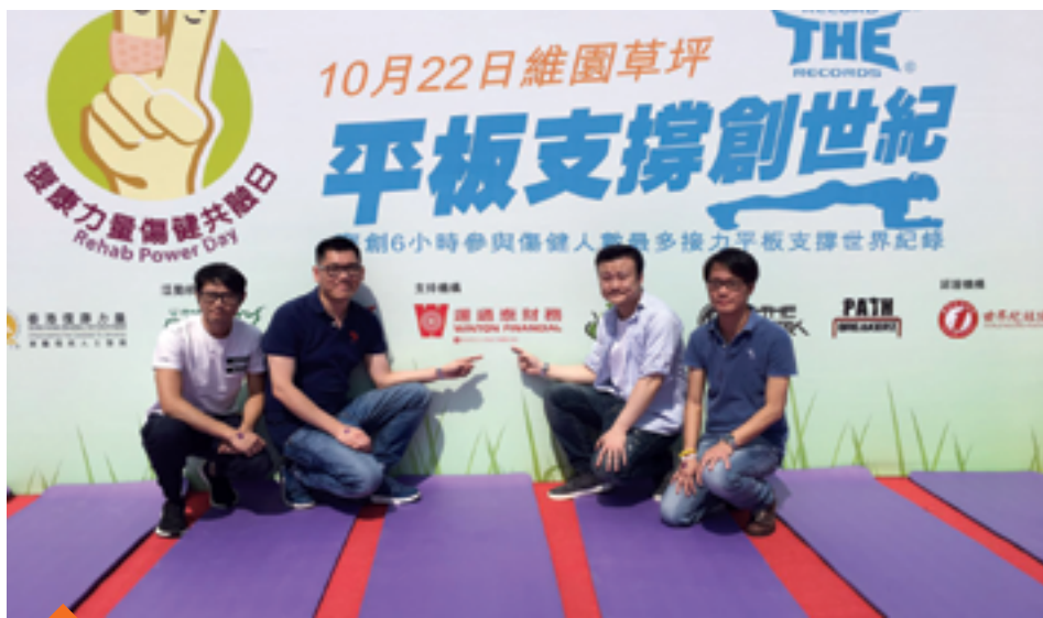
Staff posing on the stage after participating in the record-breaking "Plank" event.

At the end of the day, the "Rehab Power Day 2017" fun-raising event, participating companies received "Certificate of Appreciation" from the organizer for their support. The Winton senior managers were pleased with their staffs' team efforts over the weekend to help contribute to a worthy cause.