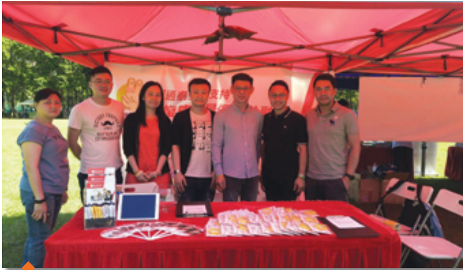
A group photo of staff with senior managers at the booth.

Winton Financial Limited (“Winton”), a subsidiary of Public Financial Holdings Limited, continues its corporate social responsibility by participating in a fund-raising event, “Rehab Power Day 2017” organized by Hong Kong Rehabilitation Power held on 21 – 22 October 2017 at Victoria Park, Hong Kong. More than 100 participating companies including Winton took part in this event by setting up exhibitors’ booths at the park. These participating companies helped to raise funds to subsidize vocational training programs for those with disabilities to increase their chance of getting employed.