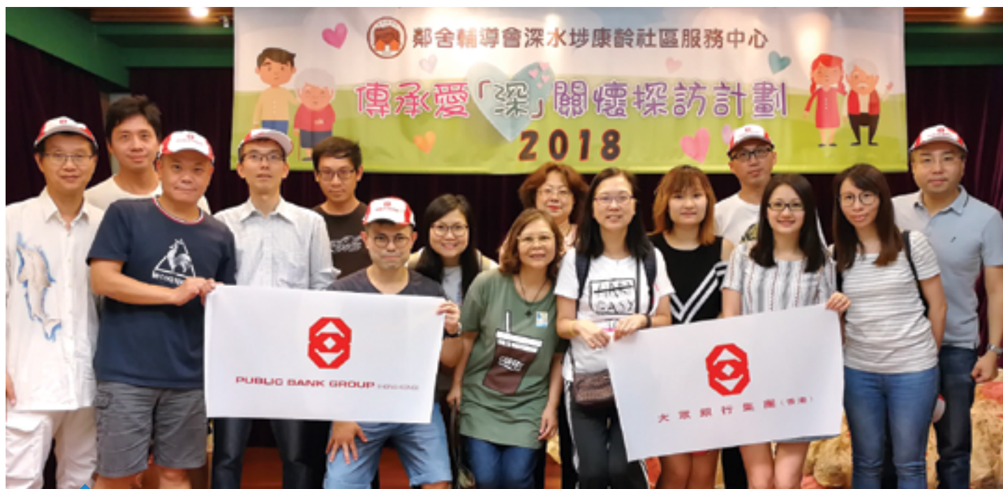
A group photo of the "PB We Care Team" volunteers at the Community Centre

The Public Bank Group (Hong Kong) Volunteer Team, "PB We Care Team" participated in a volunteer service of making home visits to the elderly organized by The Neighbourhood Advice-Action Council – Shamshuipo District Elderly Community Centre. Visiting and serving the elderly in building a caring community is one of the Group's corporate social responsibility. The home visits to the elderly in Shamshuipo District activity held on 2 June 2018 was an opportunity for the Group in supporting and promoting care to the elderly. The home visit coincided with the celebration of the Tuen Ng Festival. Gifts of food items and traditional rice dumplings were prepared for distribution to the elderly during the visit to celebrate this festive season.