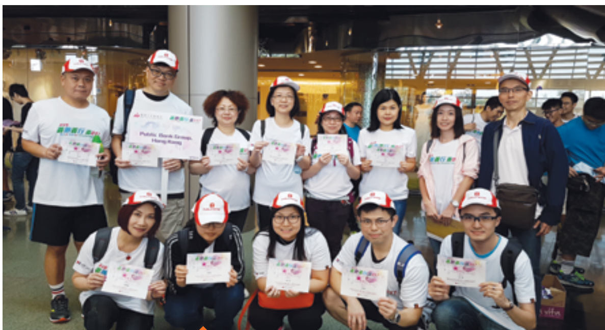
Mission Accomplished! All Smiles and happily holding their Certificate of Merit

PB義工兵團同事能參與慈善活動以幫助有需要人士及弱勢社群，實在感到十分高興。集團誠意邀請同事們踴躍支持和參與往後的各項義工活動，讓大家為集團和社會孕育出關愛的文化！