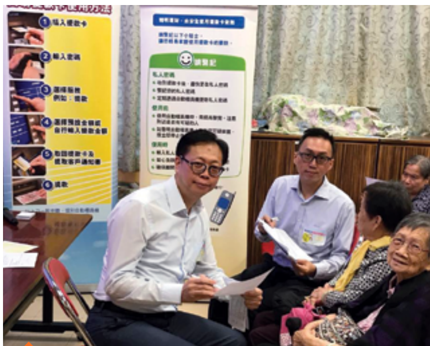
Guiding the seniors in filling up survey forms at the end of the talk.

大眾銀行(香港)通過參與這次活動履行了社會企業責任，而且承諾了積極教育長者的社會理念，並且鼓勵長者們使用自動櫃員機及享受它帶來的長處和便利。