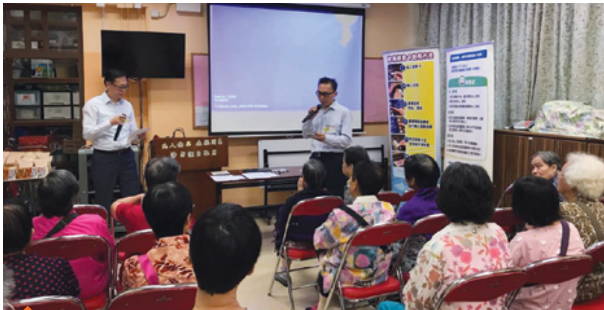
Public Bank facilitators leading the ATM talk.

Public Bank (Hong Kong) participated in Hong Kong Association of Banks (“HKAB”) corporate social responsibility initiative in their calling of member banks to be volunteers in coordinating and conducting a series of ATM Education talk to Hong Kong senior citizens at elderly community centers in different locations. The purpose of the series of ATM Education talk hosted by HKAB was to acquaint the elderly on the use of Simplified ATMs as a safe and convenient channel in assessing basic banking services.