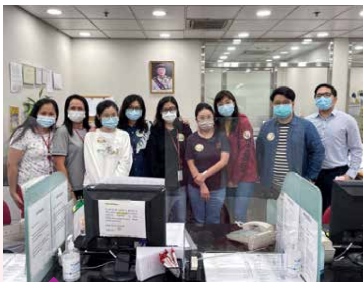
PFL Shatin Branch staff spreading team spirit and happiness