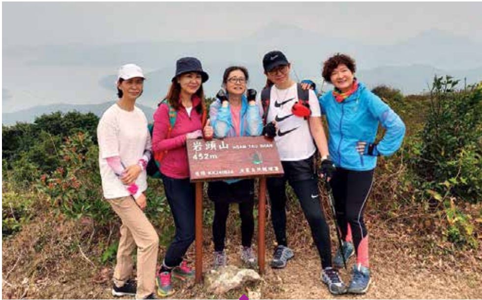
Staff posing proudly in their achievement of 10,000 steps

Public Bank Group, Hong Kong participated in the “Virtual Walk for Millions”, a fundraising activity organised by The Community Chest of Hong Kong (the “Chest”) on 9 January 2022 to 23 January 2022 in view of the COVID-19 pandemic and the implementation of social distancing measures. Each participant was encouraged to achieve 10,000 steps at any place, time and format during the event period.