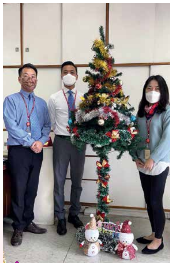
Winton Lai Chi Kok Branch supporting the activity and sending warmth to children in Christmas