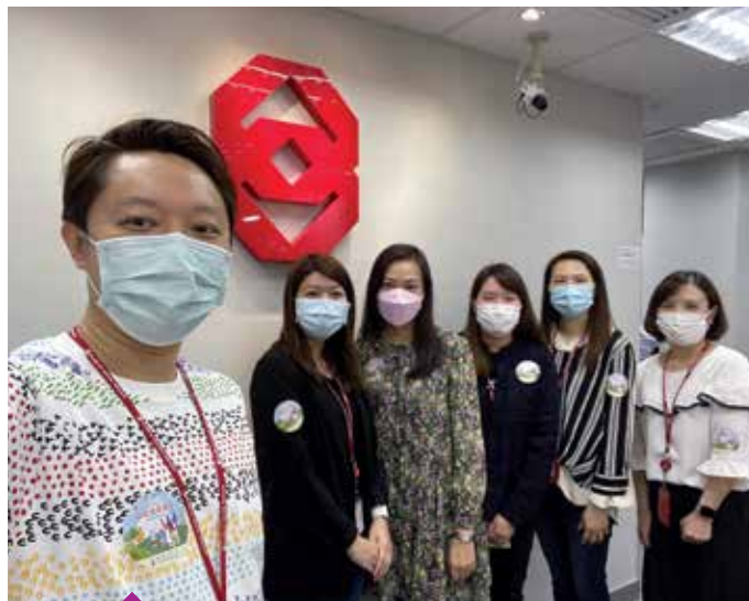
PBHK Hung Hom Branch staff smiling behind the mask