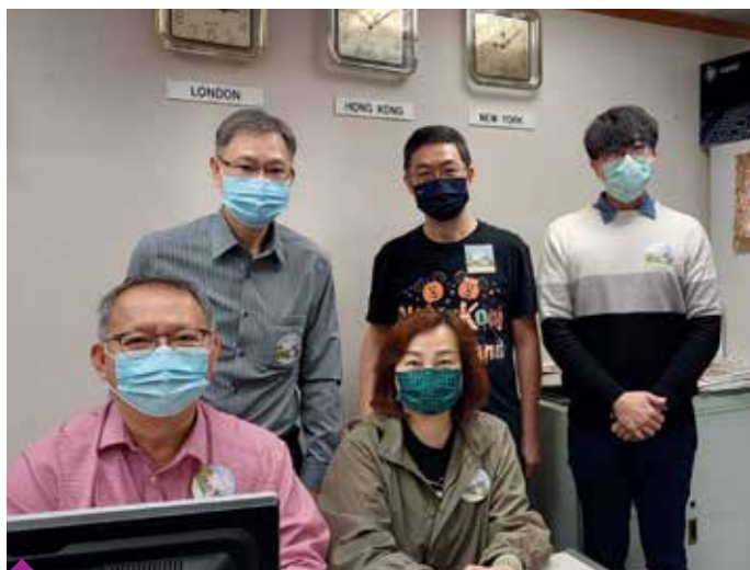
PBHK Treasury Department staff wearing their casual outfit in support of the company's charity activity