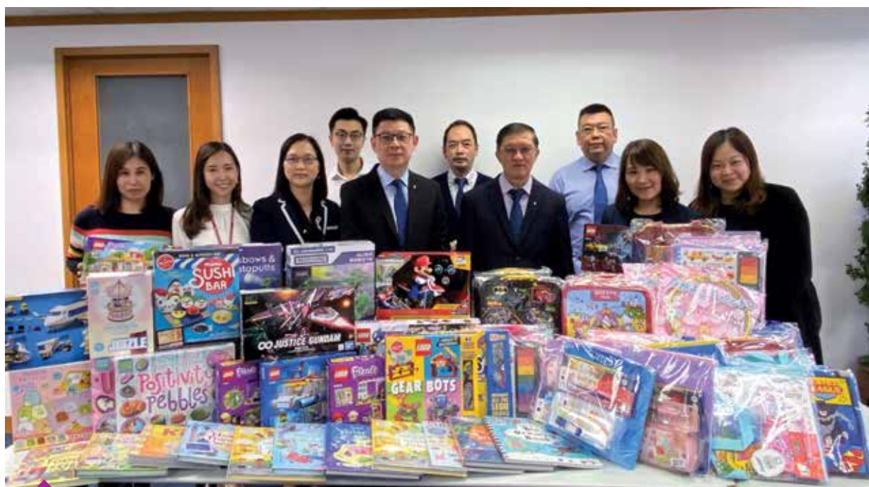
Senior Management and representatives of departments at PBHK took photo with all the Christmas gifts displayed to be delivered to the bereaved children

Public Bank Group, Hong Kong ("The Group") organized a "Christmas Gifts for Children" activity from 19 November to 10 December 2021 for the bereaved children who are undergoing counselling services provided by The Comfort Care Concern Group ("CCCG"), a non-profit charitable organization in Hong Kong that provides comfort care to the terminally ill and their families as well as the bereaved.