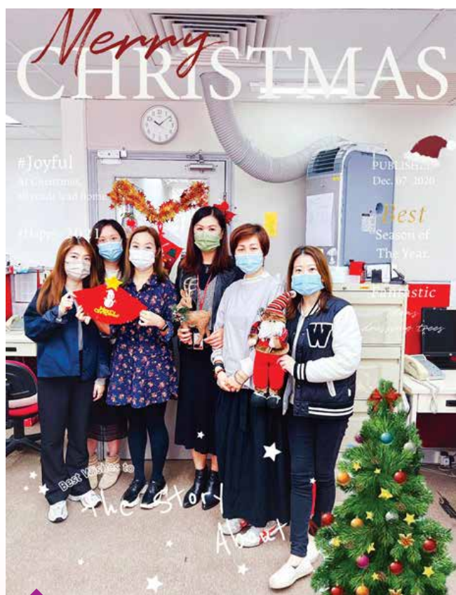
PFL staff joyfully demonstrating their love to the children in need