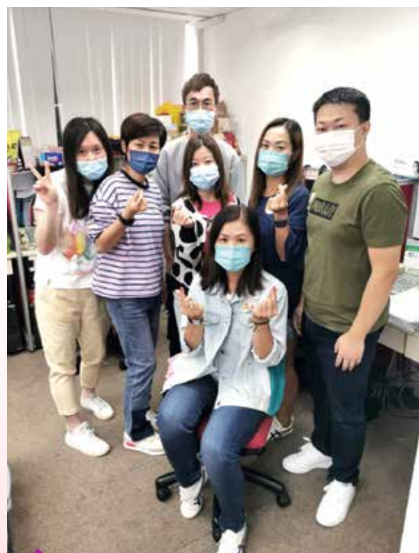
PFL Centralised Telemarketing Team staff showing their love to the community