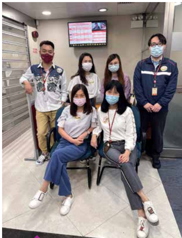
PBHK Tuen Mun Branch staff posing casually