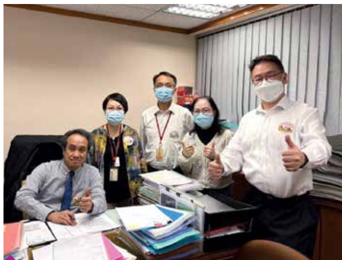
PBHK Commercial Banking Department staff proudly participating with a worthy cause

Public Bank Group, Hong Kong participated in the "Dress Casual Day", a fundraising annual activity organised by The Community Chest of Hong Kong (the "Chest") held on 28 October 2021 with the slogan "We We Wear Wear". This activity encouraged working adults and students to donate generously HK$70 or above to wear their favorite casual wear to work on that day for a worthy cause.