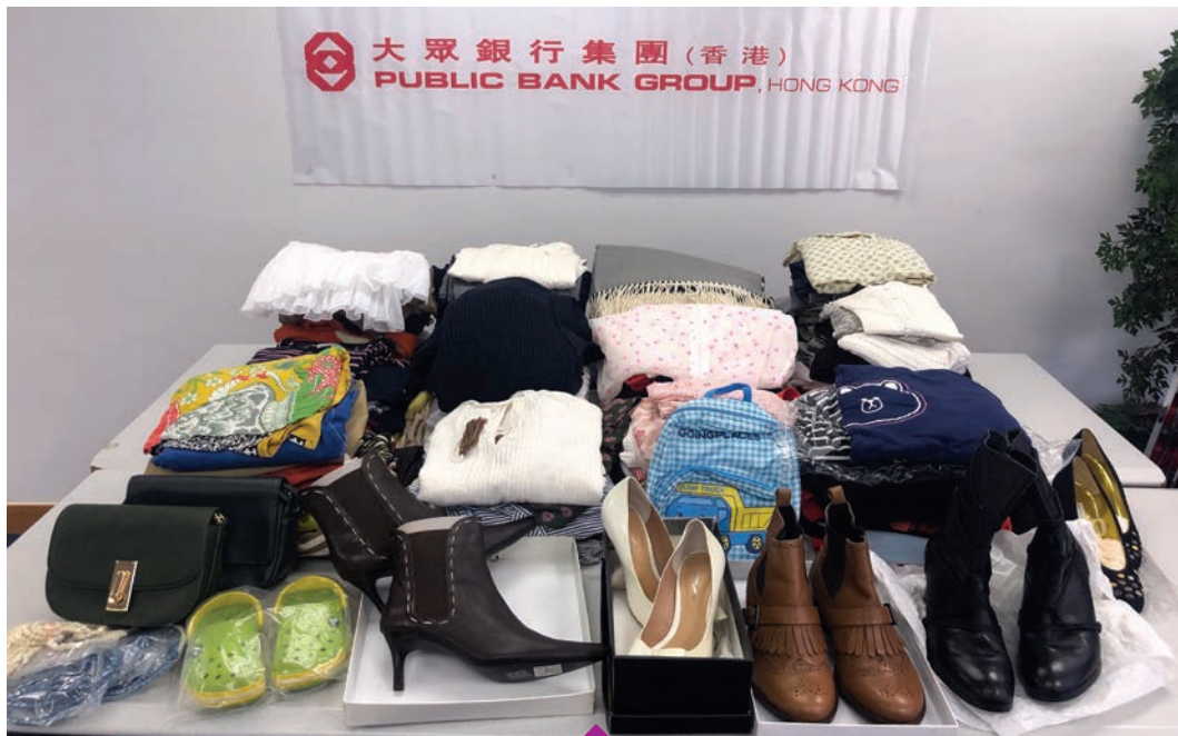
170 pieces of clothes were collected, of which 94 pieces were screened for sales at shops of Green Ladies & Green Little

Public Bank Group, Hong Kong launched clothes drive to support social enterprise operated by St. James' Settlement. Being the first social eco enterprise operated by consignment model in Hong Kong, Green Ladies & Green Little has been promoting eco-friendly habits and middle-aged ladies employment. Through collecting high quality fashion and accessories, the social enterprise promotes for sustainable use of second hand clothes. Job opportunities and regular training courses are provided to a group of underprivileged middle-aged women so as to empower their job skills and employability.