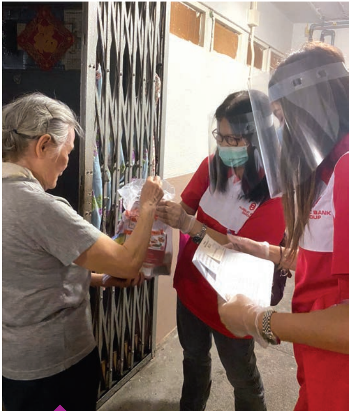
Staff volunteers delivering gift packs to the singleton elderly and chatting with them to bring them warmth and care