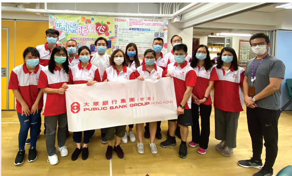
Staff volunteers are ready to distribute rice dumplings and gifts to the elderly

是次探訪，不但為長者給予溫暖和關懷，亦帶給義工一次富有意義的經歷。這次活動讓義工明白到獨居長者的苦況，啟發他們往後參與更多幫助獨居長者的義工活動，以宣揚關懷社會的精神。